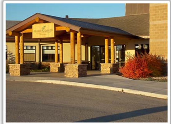
The Platte Valley Community Center is located at 210 W. Elm Avenue, Sarato-