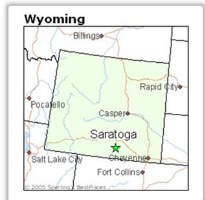
Saratoga is in Carbon County, nestled between the Sierra Madre Mountain and Snowy Mountain Ranges, on the Upper North Platte River.